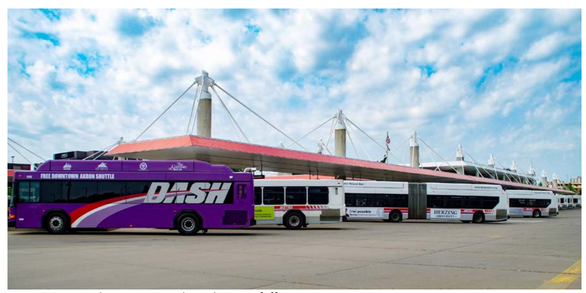
A DASH bus waiting at the Robert K. Pfaff Transit Center

DASH connects UA with many downtown locations, as well as to the Robert K. Pfaff Transit Center, the hub for the rest of METRO's line services. Since UA students and employees receive free transportation on any of METRO's routes within Summit County, DASH represents the critical first or last connection that makes the METROZip program effective and convenient.